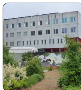
Universitair Ziekenhuis Brussel (UZ Brussel) Av. du Laerbeek 101, 1090 Jette, Belgium

BD Switzerland Sarl Terre Bonne Park -A4Route de Crassier, 17 1262 - Eysins, Vaud, Switzerland Phone: +41 21 556 30 00